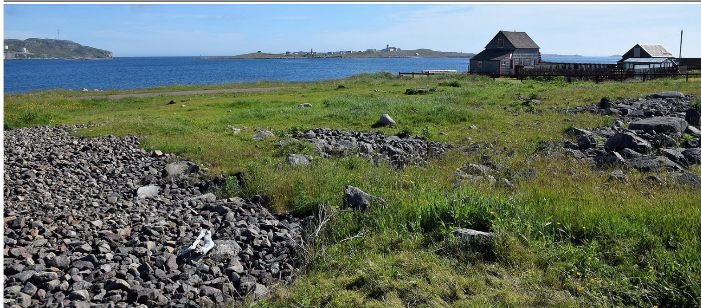
Figure 1: Anse à Bertrand, Saint-Pierre, Saint-Pierre et Miquelon.