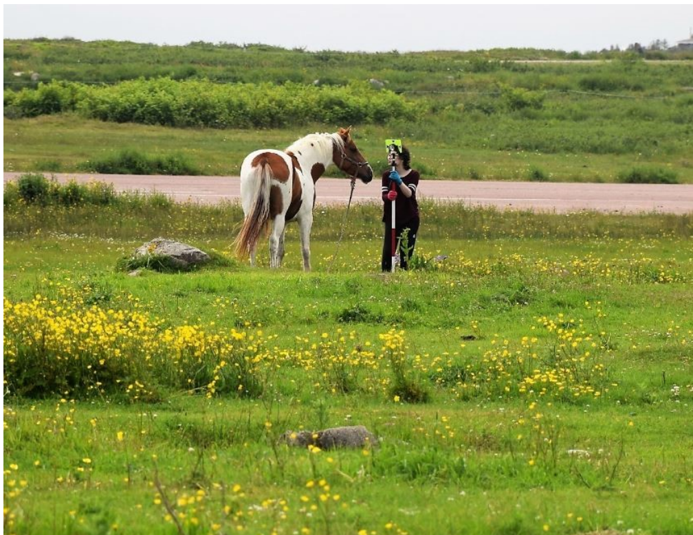
Figure 9: Student Julieanne looking for the datum with some local equine help.

throughout the season. While it has been suggested that it may be the base of a cabestan, the substantiality of the flat stone feature may not support this theory. The final goal, in red, was also successfully completed, with a preliminary hypothesis that the 18 th century context marks the terrestrial base of a stage. These hypotheses can be further developed with the complete analysis of the material culture associated with these features, which is currently underway.