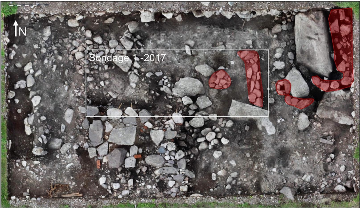
Figure 4: In red, the 18 th c. context, hypothesized to be the terrestrial base of a stage.