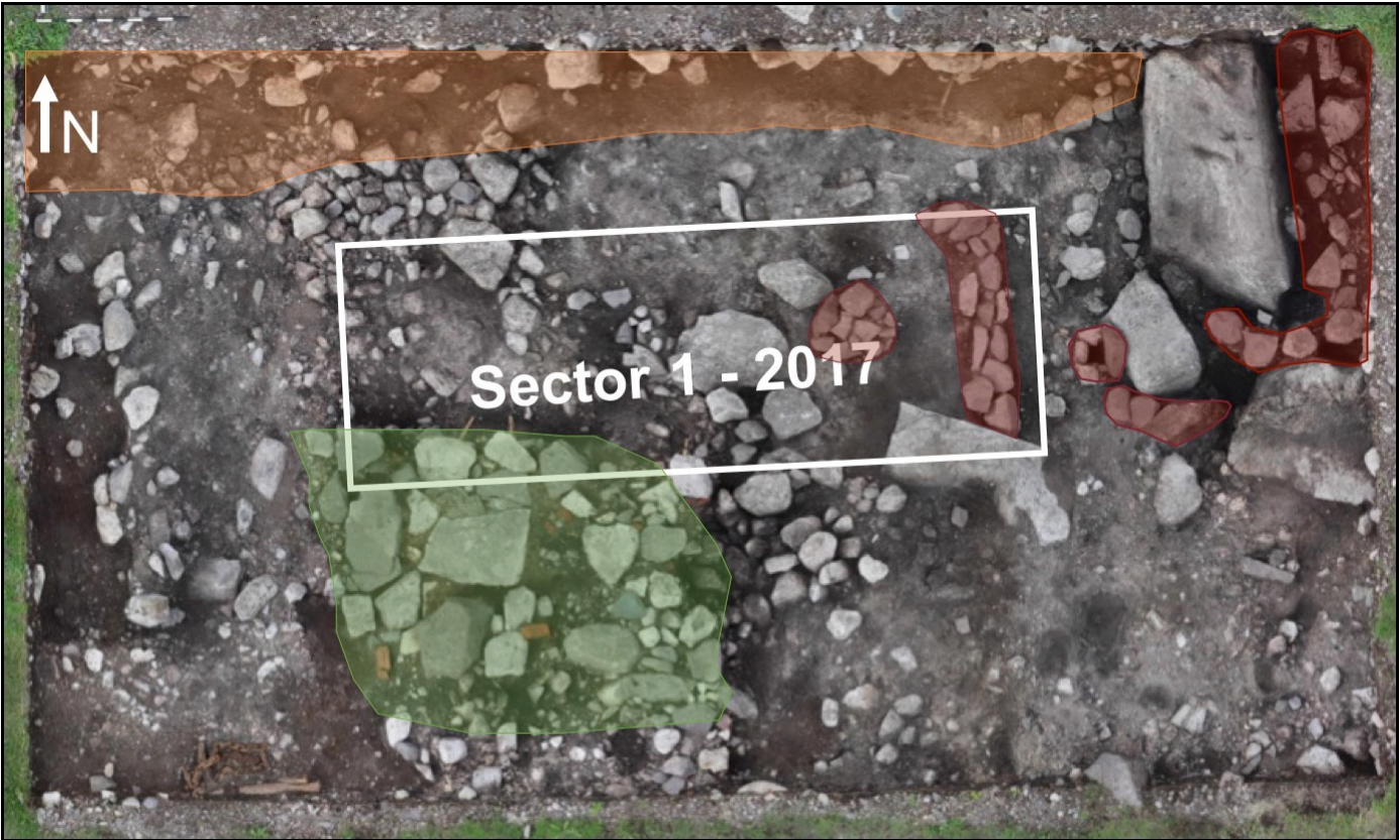
Figure 9: In orange, the limit of the site and extent of the erosion before bank rebuilding in 2005. In green, the limit of the structure discovered in the SW corner of the 2017 excavation. In red, the limit of the 18th c. structure uncovered in 2017 and 2018 field seasons.