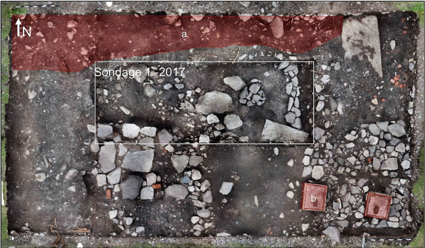
Figure 8: 21 st c. context (a) limit of erosion and fill from the reinforcement of the shoreline in 2005 (b) base of park bench.